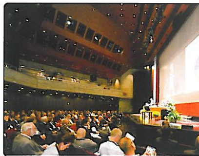
The Austrian Man-Made Fibers Institute anticipates more than 800 participants this year.